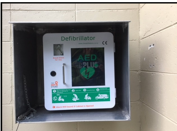
The defibrillator at 3160 Archers Road

davies@kinect.co.nz berylarcher@xtra.co.nz